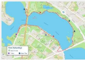
Saturday MarchMingle 7km