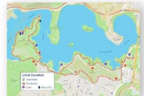
Sunday 12km Walk