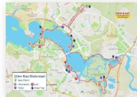
Saturday 21km Walks