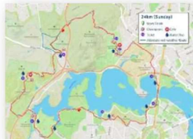
Mountain 24km Walk