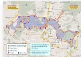
Marathon 42km Walk

Friday 22 March: 4.45pm Flag Ceremony, 5pm Opening Ceremony at World Peace Bell