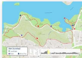
Sunday MarchMingle 7km